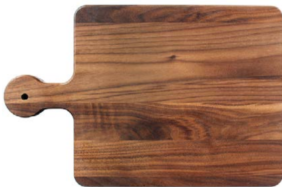
CUTTING BOARD WITH ROUNDED HANDLE

Model number: 065 10 1/2" X 16" X 3/4" (chopping area 10 1/2" X 12")