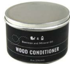
Model number: COND 8 OZ

This wood conditioner will not only preserve the board, it will prevent stains and cracks from happening. To ensure longevity of the board, condition at least once a month.