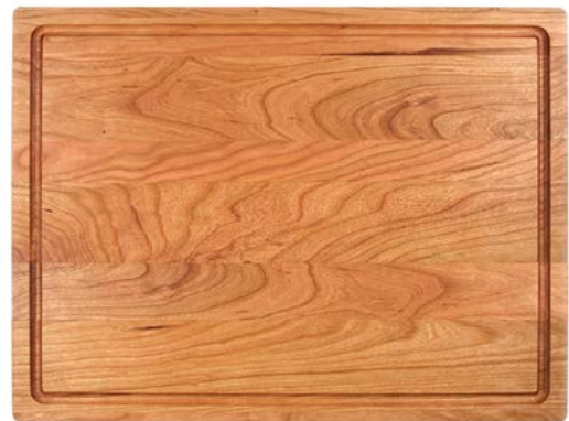
LARGE FLAT GRAIN CUTTING BOARD WITH ROUNDED EDGES & JUICE GROOVE