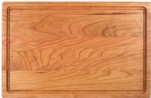
CUTTING BOARD WITH ROUNDED EDGES & JUICE GROOVE