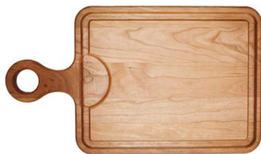
WOOD CUTTING BOARD WITH JUICE GROOVE, RESERVOIR & ROUNDED HANDLE

Model number: 057 10 1/2" X 18" X 3/4" (serving area 10 1/2" X 13")